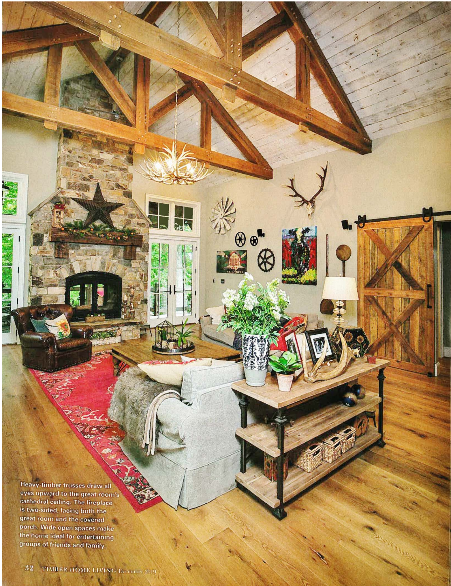
Heavy-timber trusses draw all eyes upward to the great room's cathedral ceiling. The fireplace is two-sided, facing both the great room and the covered porch. Wide open spaces make the home ideal for entertaining groups of friends and family.