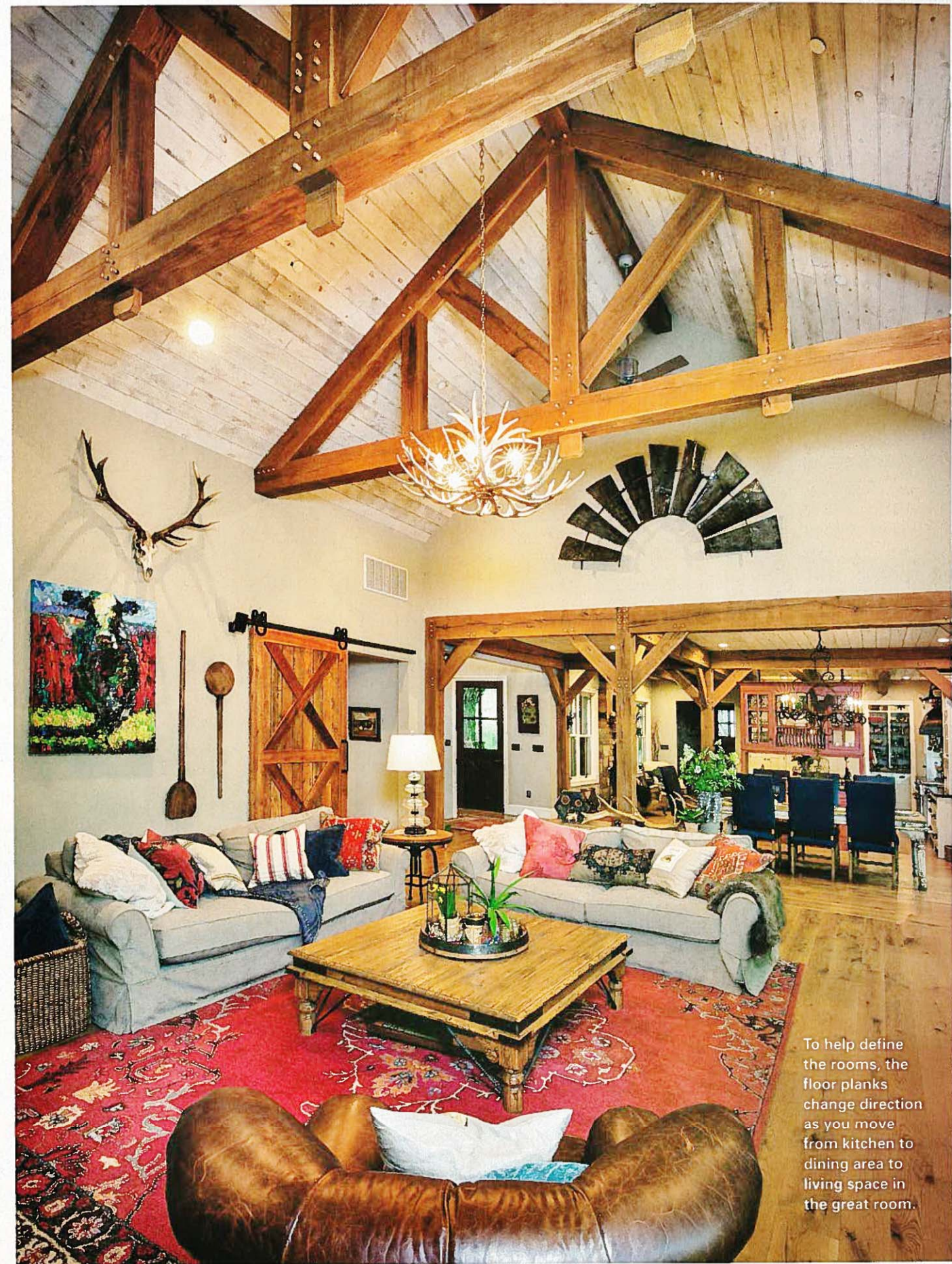
To help define the rooms, the floor planks change direction as you move from kitchen to dining area to living space in the great room.