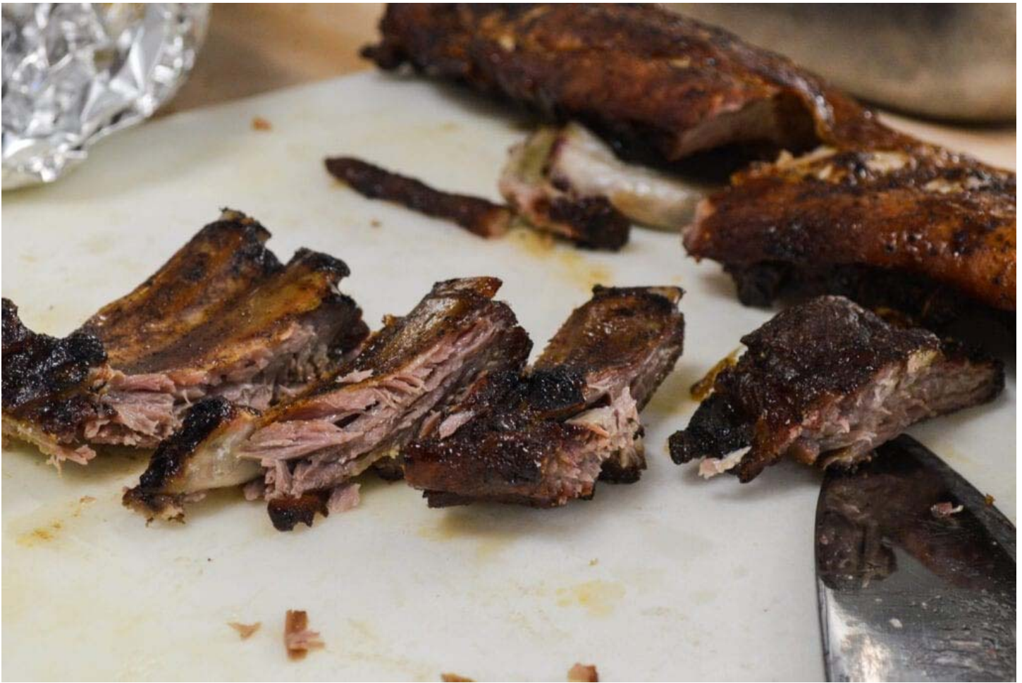
Catalano expects his patrons to really enjoy the smoked meats on the eatery's menu.