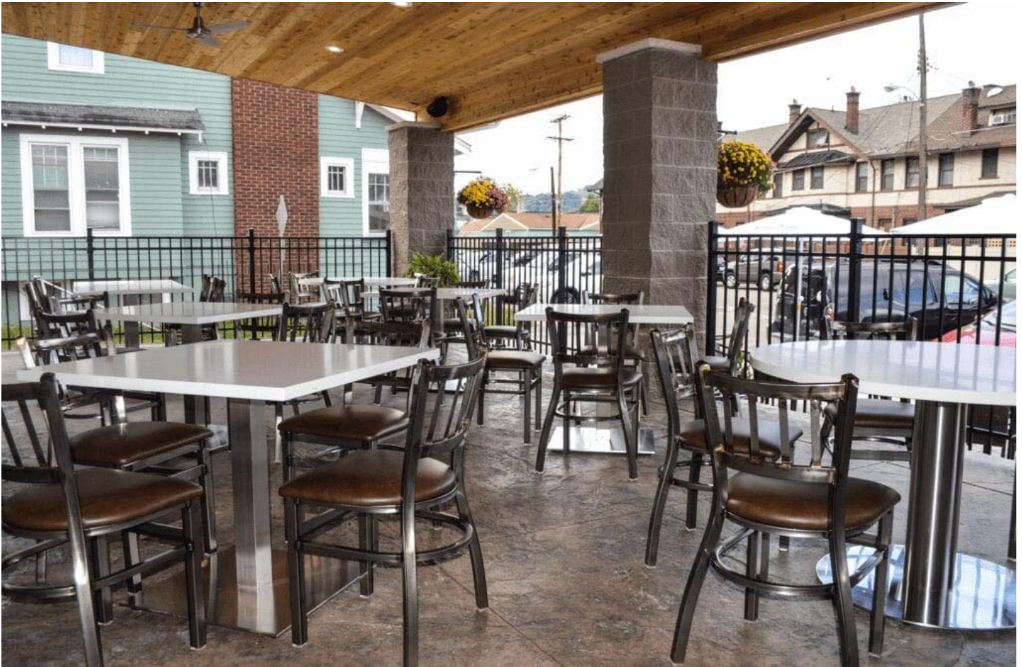
There are heaters on the patio so future patrons will be warm while they eat.