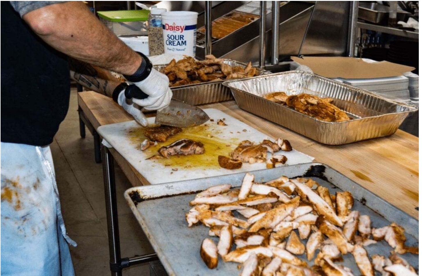
The kitchen crew members at the Alpha Tavern have been practicing the preparation of item of the new menu for a few weeks.