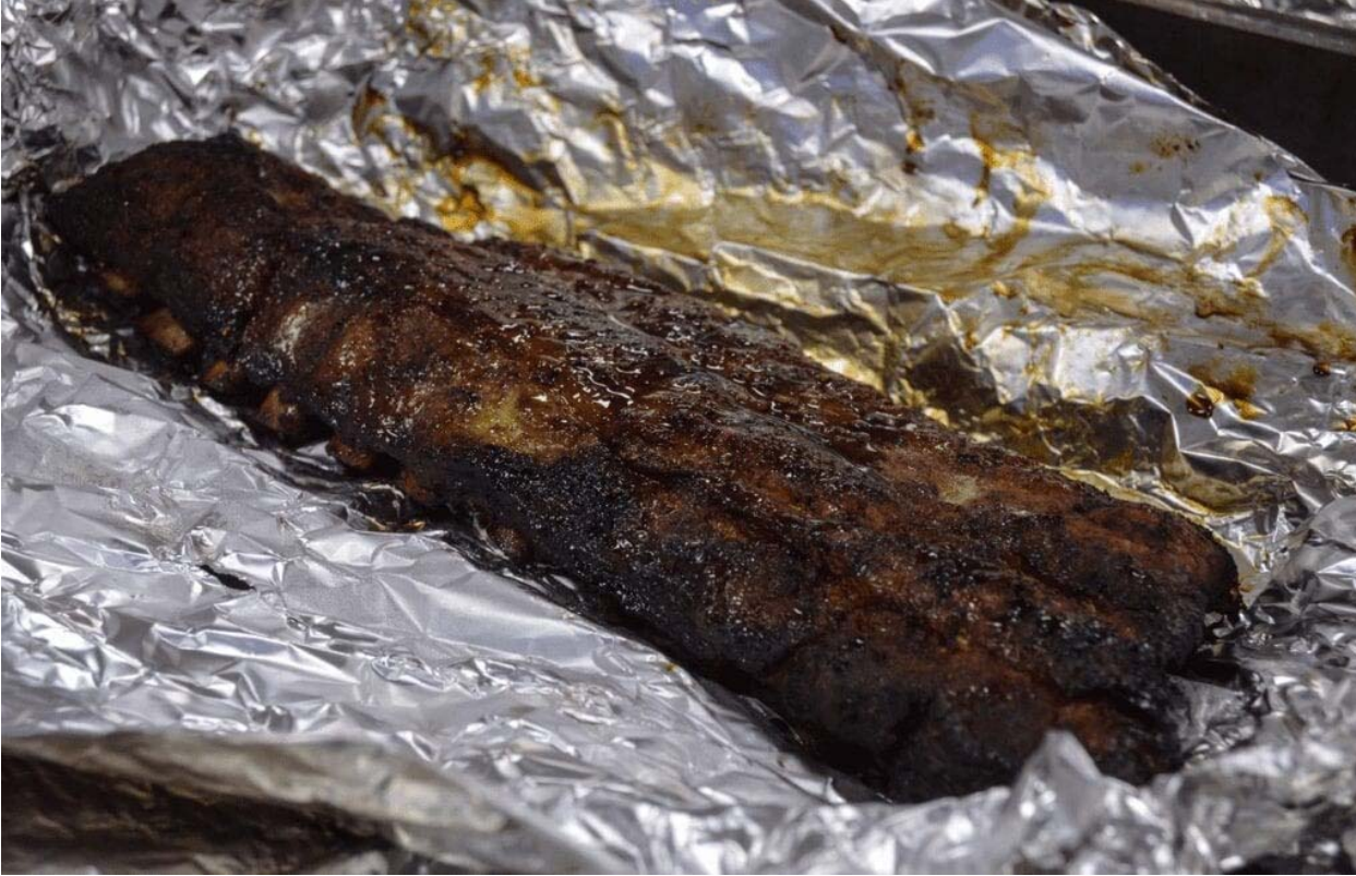
The rubbed and smoked ribs will be one of a few different meats on the menu.

"Over the next week, our catering division is scheduled to feed thousands of people, so our crew members will take care of those commitments first and then get it going here at the Alpha Tavern," he explained. "We're going to be here for many years, so when we open, we want to do it the right way."