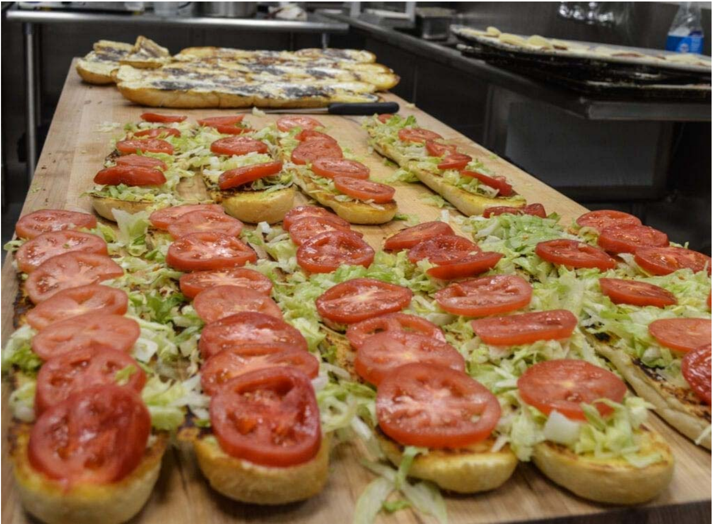
The Alpha Tavern prepared lunch on Monday for the people who helped transform the property since February.