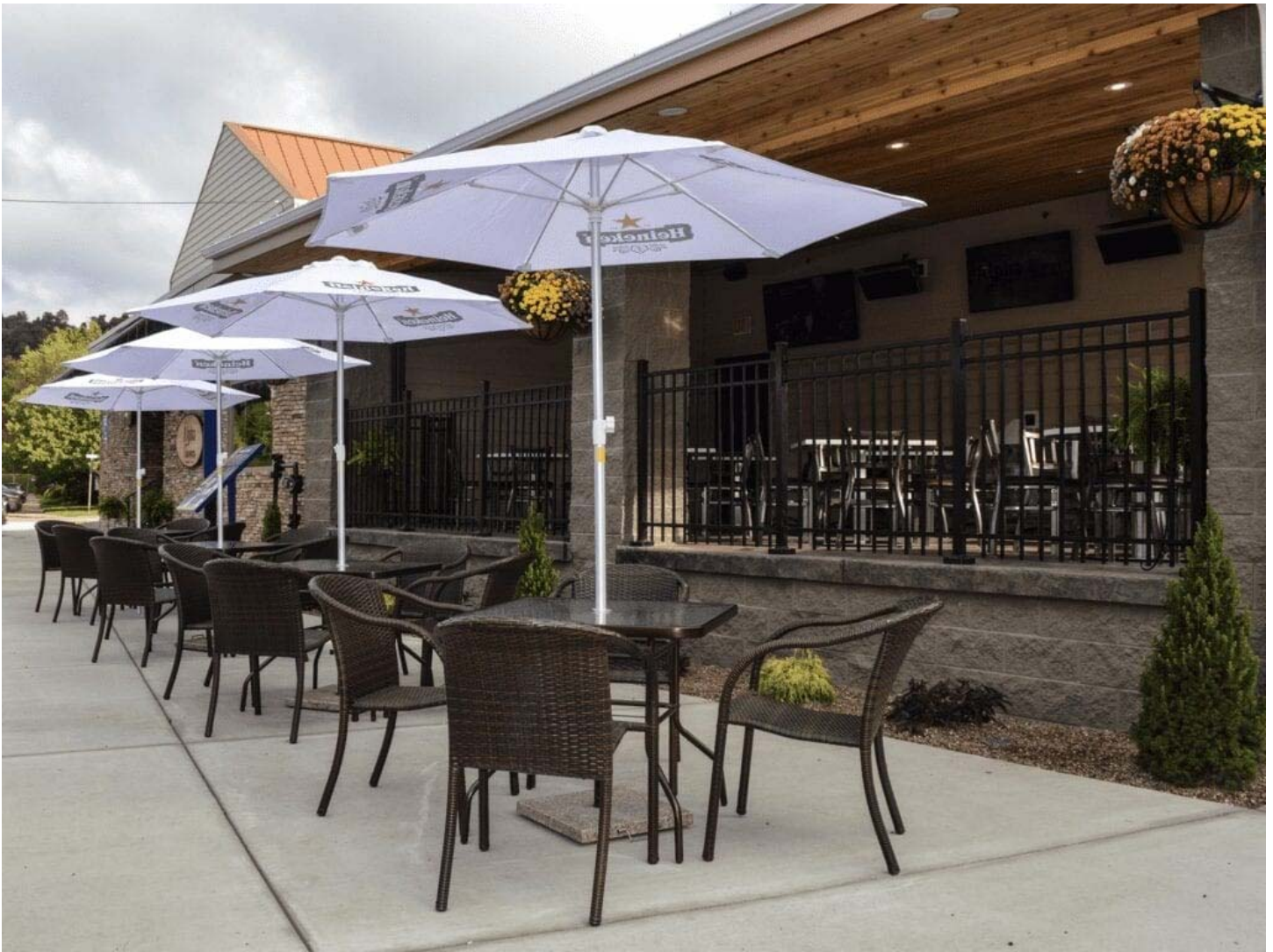
Outdoor dining will be available at the Alpha Tavern as long as the weather allows.