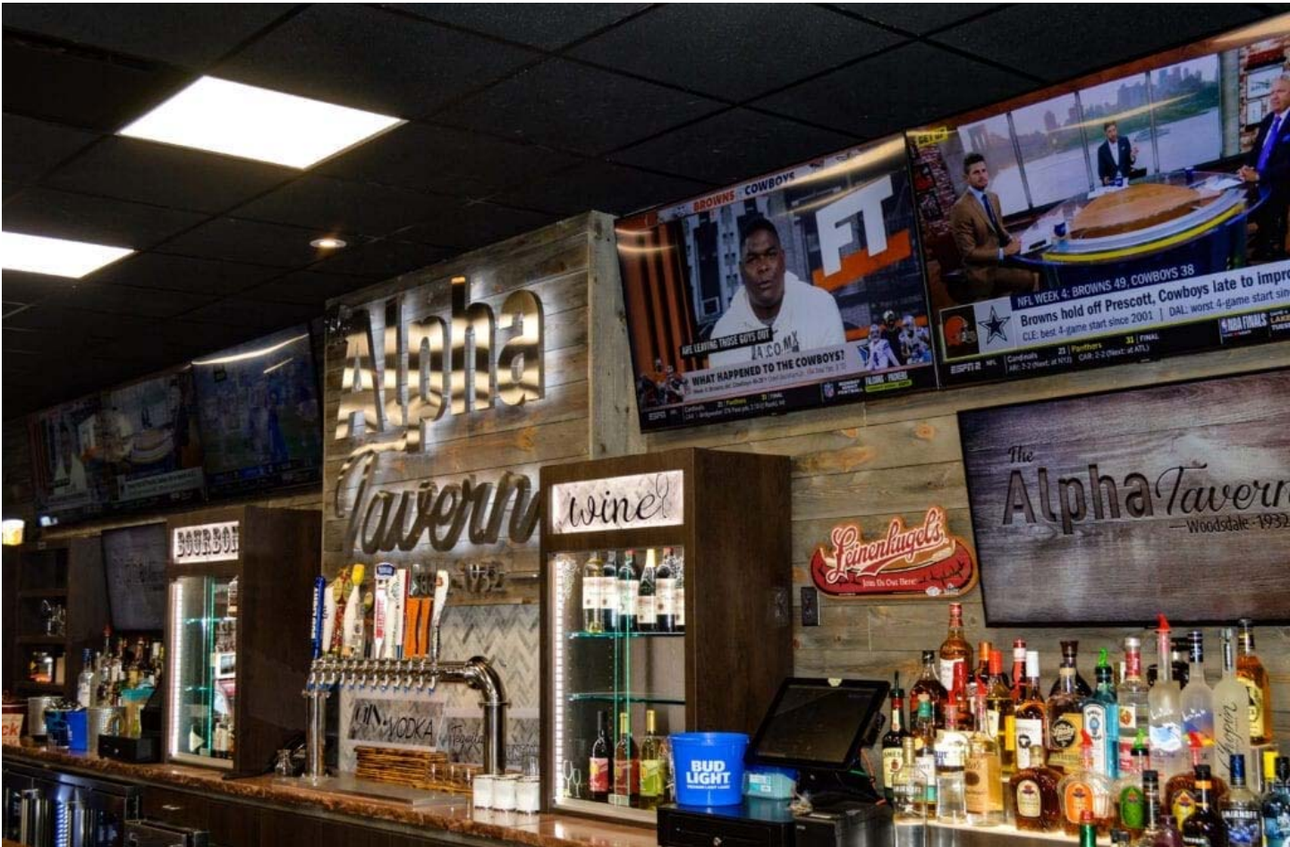
Flat-screen TVs are a new feature in the bar and dining areas.